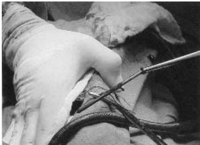
Figure 1. This shows the third sixteen penny nail removed from the chest during cardiopulmonary bypass.