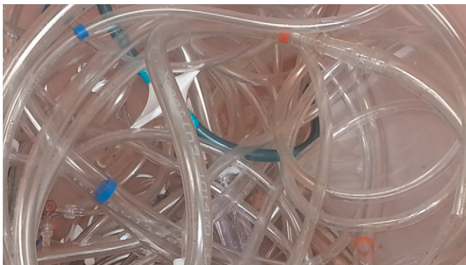
Figure 2. Effectiveness of perfusion circuit rinsing.

This technique represents another way for perfusionists to participate in sustainability efforts within their medical facility. Diverting the bypass circuit to clear bag waste results in reduced environmental impact and annual cost