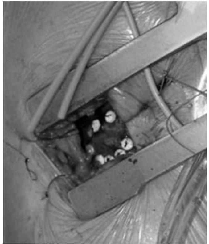
Figure 1. Left ventricular apex with purse-string sutures reinforced with pledgets from a left mini-thoracoscopic incision at 4th intercostal space.

TLVV implantation was performed in intensive care unit after a mean period of 12.2 \pm 3.4 hours from the beginning of VA-ECMO support. Following the protocol for trans-apical transcatheter aortic valve implantation, trans-thoracic echocardiogram was performed to precisely locate the LV apex on the chest surface and a mini-thoracotomy of nearly 4 cm was performed into the 5th or 4th intercostal space. After the pericardium was opened, two 2/0 prolene purse-string sutures reinforced with pledgets were placed on the LV apex (Figure 1). Cannulation was performed using Seldinger technique with an arterial high-flow 21–23 Fr cannula (EOPA ® Arterial cannula, Medtronic ® , Minneapolis, MN). The TLVV size was chosen to achieve the best ventricle drainage. In our experience, optimal left ventricular unloading required maximizing ventricular drainage, so we decided to use this kind of high flow cannulas. The cannula was inserted over the wire for 5–8 cm, according to LV dimension and wall thickness and oriented toward the mitral valve plane with transesophageal echo